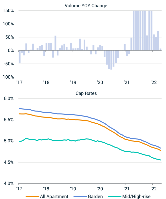
Trailing 12-mth cap rates; volume YOY change truncated at 150%